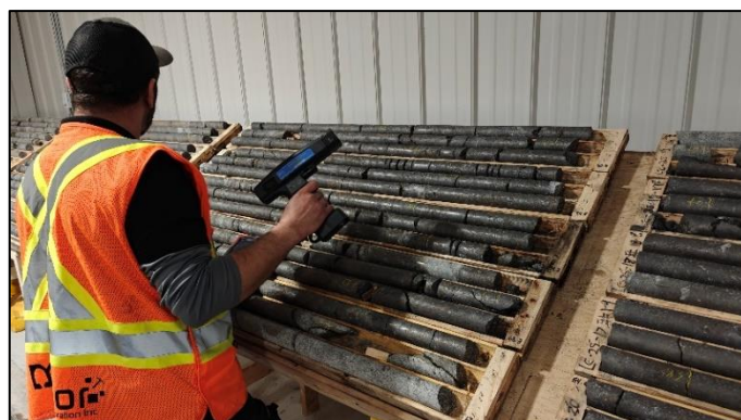
Image 1 – Drilling rig at the Lac Carheil Project – Feb 2025 & Image 2 – Core logging in Fermont prior to dispatch to Magnor HQ in La Baie, Quebec for comprehensive logging and sample preparation.