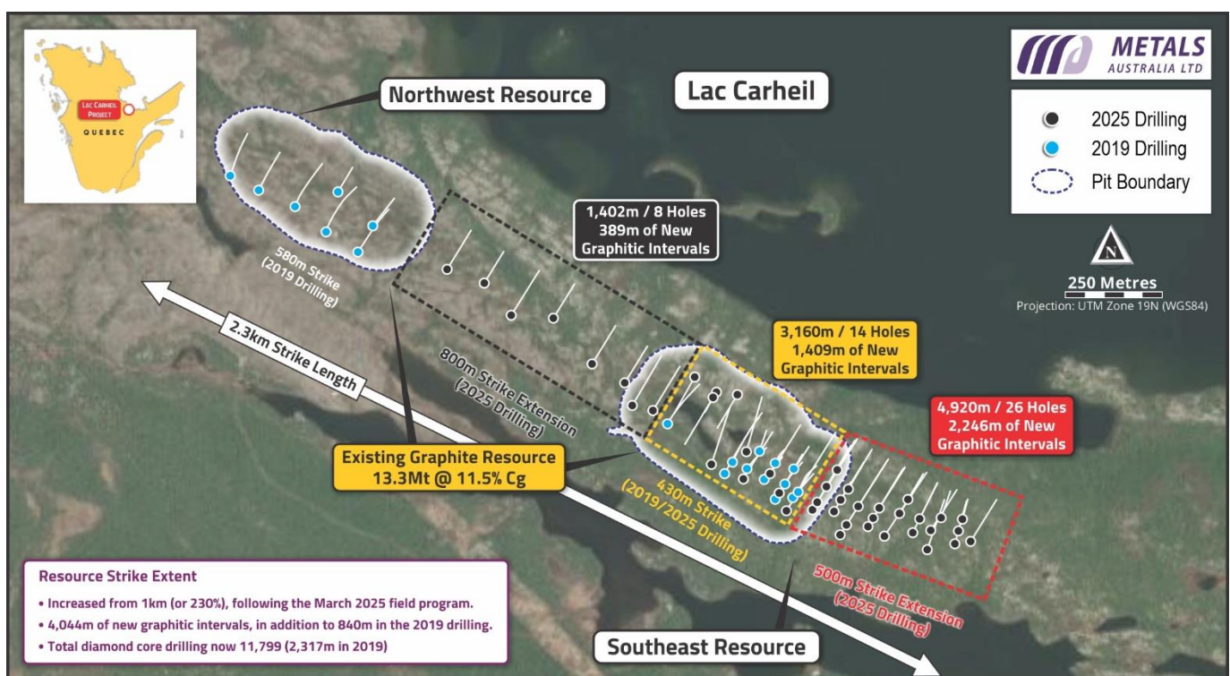
Figure 1 - Lac Carheil Graphite Project – Existing Mineral Resource zones and drill holes (blue collars) and new drilling zones and drill holes (black collars). Zone meters drilled, graphite intervals logged, and strike length are also noted.

The recent grant funding support by the Quebec government helps to reinforce the significance with which our program is being viewed in Quebec.”