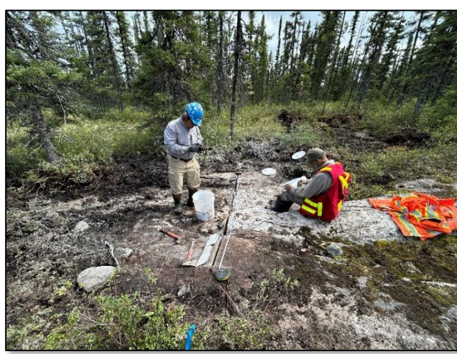
Photo 3 & 4: Western side of East Eade - Quartz outcrop exposed & diamond saw cutting & sampling. More program photos can be viewed on the company website.