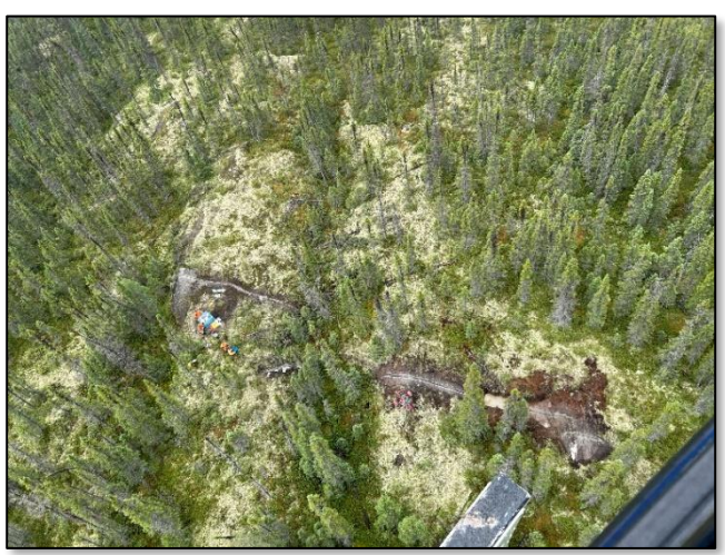
Photo 1: Helicopter at East Eade, Photo 2: Trenching preparation, eastern end of East Eade (see Figure 1)