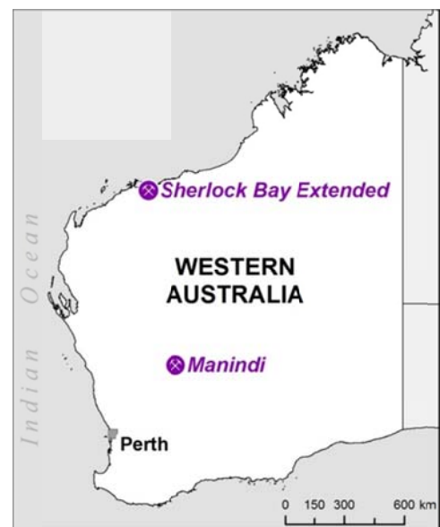
Figure 1 – Location of the Western Australian base metals projects.

Geological and economic assessment of the Manindi project continued.